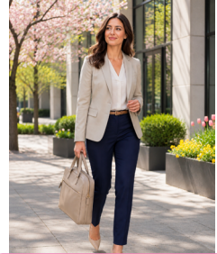
June Commuter Fares >