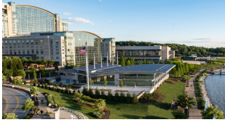
GAYLORD NTL RESORT GETAWAY National Harbor & Alexandria, VA May 25 (Sat) - 26 (Sun)

Includes: Spirit Cruise Lunch Cruise, Gaylord National Resort & Convention Center, National Harbor, The Capital Wheel, & Tall Ship Providence – Dockside Tour.