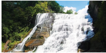
THE FABULOUS FINGER LAKES New York June 26 (Wed) - 28 (Fri)

Includes: Six Mile Creek Vineyard, "Experience! The Finger Lakes of the Fabulous Falls Above Cayuga Tour", Granger Museum & Carriage House, The Canandaigua Lady Cruise, "It's A Wonderful Life" Museum, & Ventosa Vineyards.