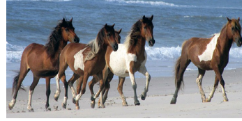
MARYLAND'S EASTERN SHORE Horses, History & Harriet Tubman June 10 (Mon) - 12 (Wed)

Includes: Guided Tour of Chesapeake City, Assateague Visitor's Center & Cruise, Ocean City Life Saving Museum, & Guided Harriet Tubman Tour.