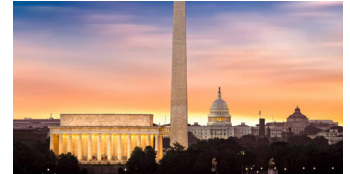
WASHINGTON, DC June 21 (Fri) - 23 (Sun)

Includes: George Washington's Mount Vernon, Illuminated Tour of DC, Arlington National Cemetery, & Steven F Udvar-Hazy Center – Air & Space Museum.