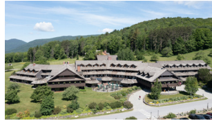
ALL THINGS VERMONT July 9 (Tue) - 12 (Fri)

Includes: Morgan Horse Farm at UVM, Rock of Ages – Granite Quarry, Trapp Family Lodge, Church St Marketplace, Spirit of Ethan Allen, & Ben & Jerry's.