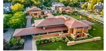
"ALL WRIGHT ALL DAY" Buffalo, NY July 24 (Wed) - 26 (Fri)

Includes: Blue Sky Mausoleum in Forest Lawn Cemetery, Frank Lloyd Wright's Martin House, Graycliff, & Seneca Buffalo Creek Casino.