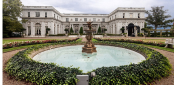
NEW ENGLAND ISLAND HOPPING June 3 (Mon) - 7 (Fri)

Includes: Nantucket, Guided Tour of Martha's Vineyard, Narrated Tour of Block Island, Guided Driving Tour of Newport, & Rosecliff Mansion.