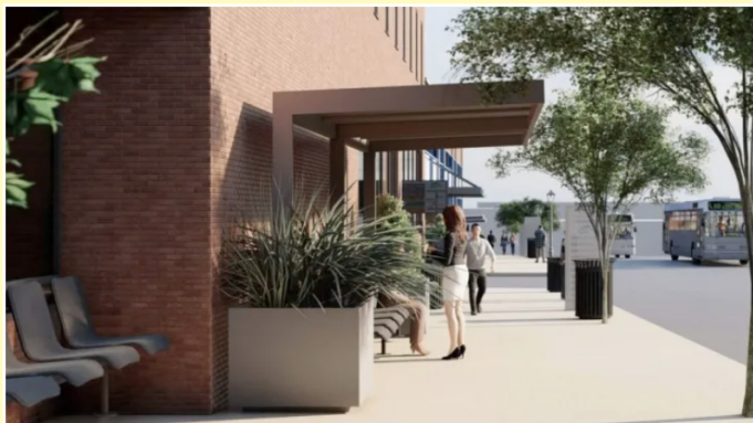
A rendering of the renovations to the Bethlehem Transportation Center.

Note: Wednesday, November 22, is one of the busiest travel days of the year! As such, our staff will monitor passengers counts on all runs and provide additional buses for heavily traveled routes.