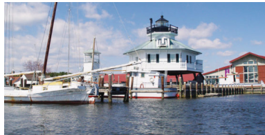
New! MARYLAND'S EASTERN SHORE Horses, History, & Harriet Tubman May 20 (Sat) - 22 (Mon)

Berlin - One of the "Coolest Small Towns" in America, Assateague Island - "Home of the Wild Ponies", Chesapeake Bay Maritime Museum, St. Michaels Patriot Cruise, Harriet Tubman Underground Railroad Visitor's Center, Tour of the Blackwater Refuge & Bucktown Store.