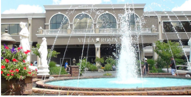
VILLA ROMA RESORT - CATSKILLS, NY with Italian Festival April 24 (Mon) – 25 (Tue)

For tour information, click HERE . To make a reservation, click HERE or call 610-868-6001.