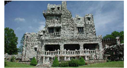
New! CHARMING CONNECTICUT River Valley Region & Hartford June 13 (Tue) - 15 (Thu)

Guided Tour of Hartford, Connecticut State Capitol Tour, Mark Twain House & Museum, Gillette Castle State Park, Goodspeed Opera House Show - "Gypsy".