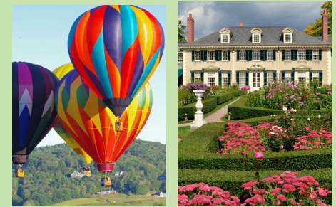
New! QUECHEE BALLOON FESTIVAL Vermont June 16 (Fri) - 18 (Sun)

Take in the beauty of equestrian stallions with a tour & show performance at Friesians of Majesty! Learn about Vermont's rural heritage at Billings Farm & Museum in Woodstock, complete with interactive programs & award-winning exhibits. Shop unique Vermont artisans at Quechee Gorge Village with everything from live alpacas to antiques & wine! The skies the limit at Quechee Hot Air Balloon Festival featuring up to 20 balloons, vendors, & a beer & wine garden! Finish the tour with a visit to Hildene Estate, the Lincoln Family Home of Abraham's son Robert.